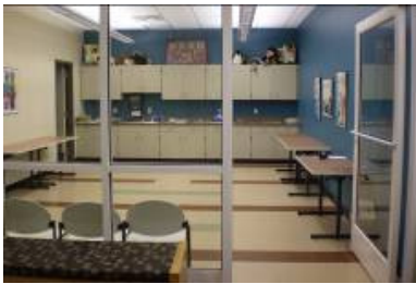
Program Room (view from outside looking in)

The Program Room measures 24' x 16'. The 24' (east and west) walls have ample space for art. The north wall has a work counter and overhead cabinets with about a 2' space above the cabinets. The south wall has windows looking out into the corridor.