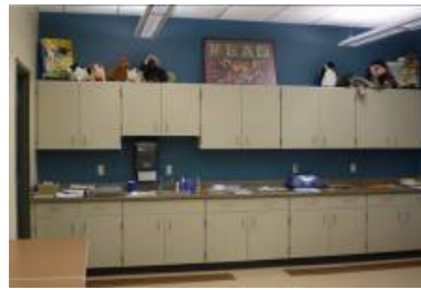
North wall inside Program Room