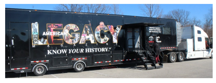
500 Attendees at 11 Black History Month Programs

...including the American Legacy travelling exhibit on Feb. 8 at Benjamin L. Hooks Central Library.